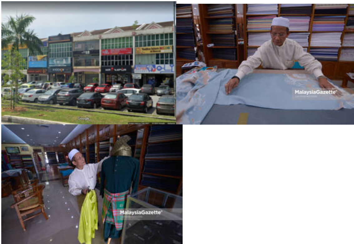
Kiri: Wisma Tum @ Seksyen 9, Pusat Bandar Baru Bangi.