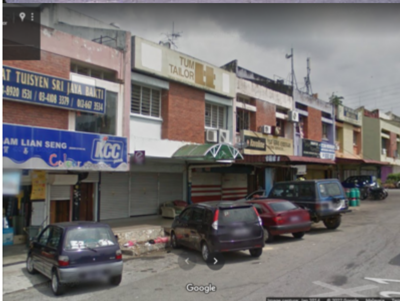
Kiri: Premis No.4, Jalan 1/4, Seksyen 1, Bandar Baru Bangi, pernah menjadi pejabat sementara PUSPATI sekitar 1981-1983 ( LATAR PERISTIWA: PUSPATI ).