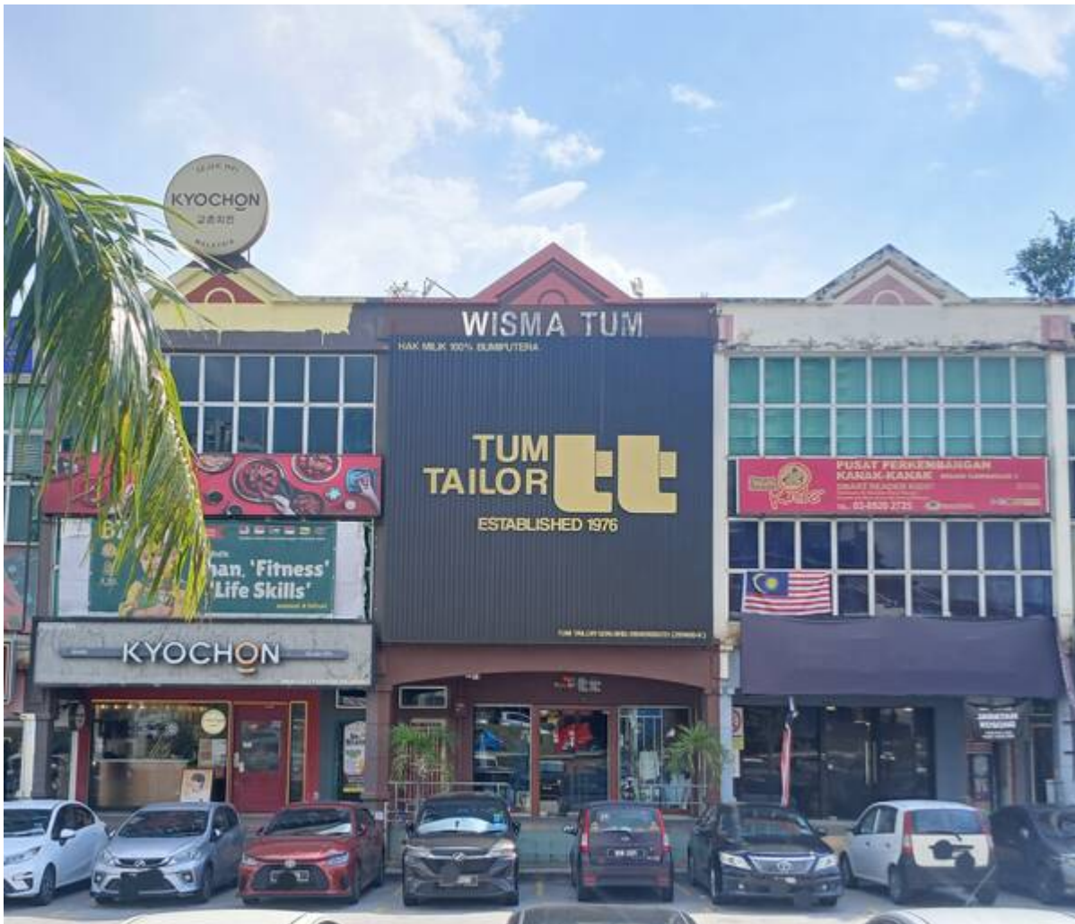
Wisma Tum di Seksyen 9 Bandar Baru Bangi, 24 September 2025.