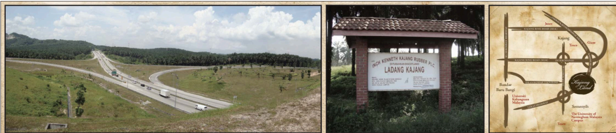
Kawasan Ladang Kajang yang bakal dibangunkan.