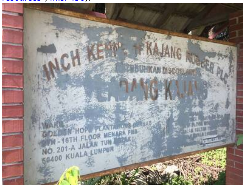
Papan tanda Ladang Inch Kenneth, Kajang

" Twentieth century impressions of British Malaya: its history, people, commerce, industries, and resources ", m.s. 456).