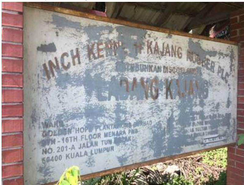
Papan tanda Ladang Inch Kenneth, Kajang

| "Twentieth century impressions of British Malaya: its history, people, commerce, industries, and resources", m.s. 456).