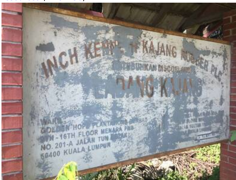
Papan tanda Ladang Inch Kenneth, Kajang

" Twentieth century impressions of British Malaya: its history, people, commerce, industries, and resources ", m.s. 456).