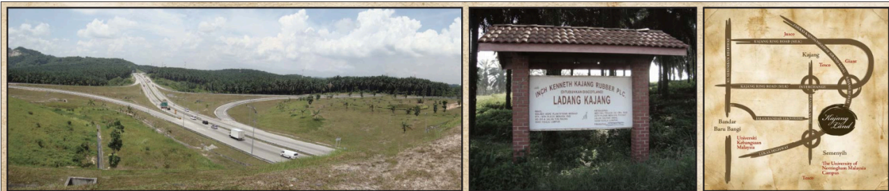
Kawasan Ladang Kajang yang bakal dibangunkan.