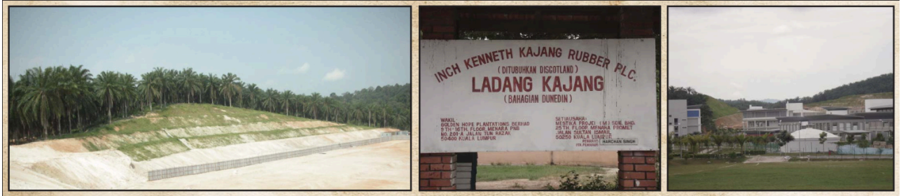
Kawasan Ladang Dunedin , Bangi yang bakal dibangunkan.

Sumber utama: Inch Kenneth Rubber Estates Limited , 2010: