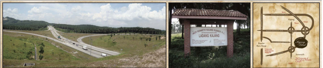
Kawasan Ladang Kajang yang bakal dibangunkan.