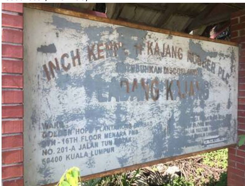
Papan tanda Ladang Inch Kenneth, Kajang

" Twentieth century impressions of British Malaya: its history, people, commerce, industries, and resources ", m.s. 456).