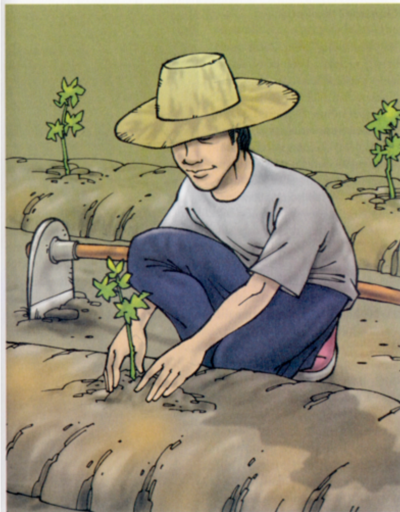
Pada masa lalu, pokok yang dinamakan limau manis ditanam dengan meluas oleh petani di Kampung Limau Manis.

yang berbuah dan sangat manis rasanya. Rupa buah itu seperti Limau tetapi rasa manisnya berbeza dengan rasa jenis-jenis Limau yang lain yang kebiasaannya masam. Kemudiannya, mereka telah memperkembangkan tanaman tersebut dengan menanamnya di celah-celah tanaman pokok Pinang dan Belinjau. Akhirnya tanaman ini telah berkembang di kawasan mereka dan ramai orang mengenalinya sebagai Limau Manis. Oleh itu nama kampung ini telah digelar sebagai Kampung Limau Manis."