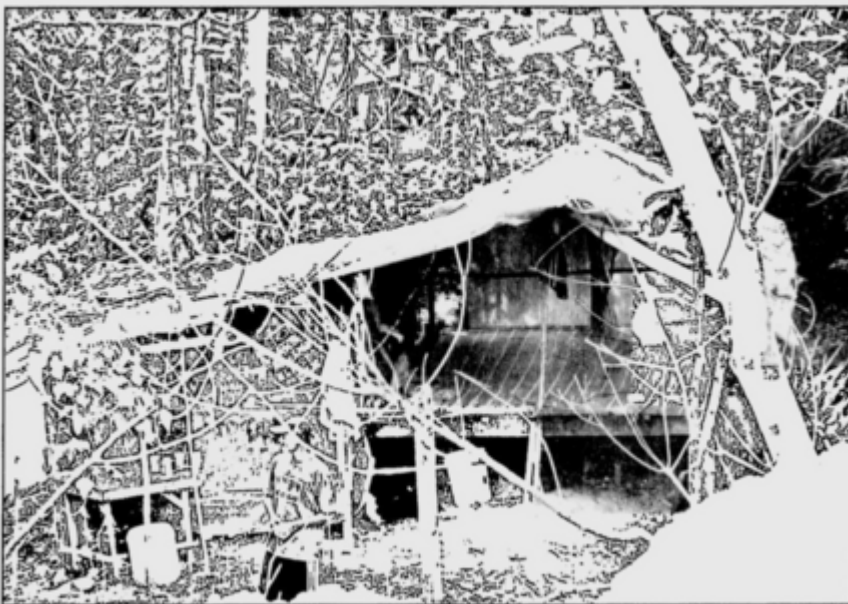
EVIDENCE ... Some of the make-shift houses constructed of pieces of wood and canvas.

Perkampungan warga asing di Kampung Limau Nipis (New Straits Times, 12 Feb 2000: