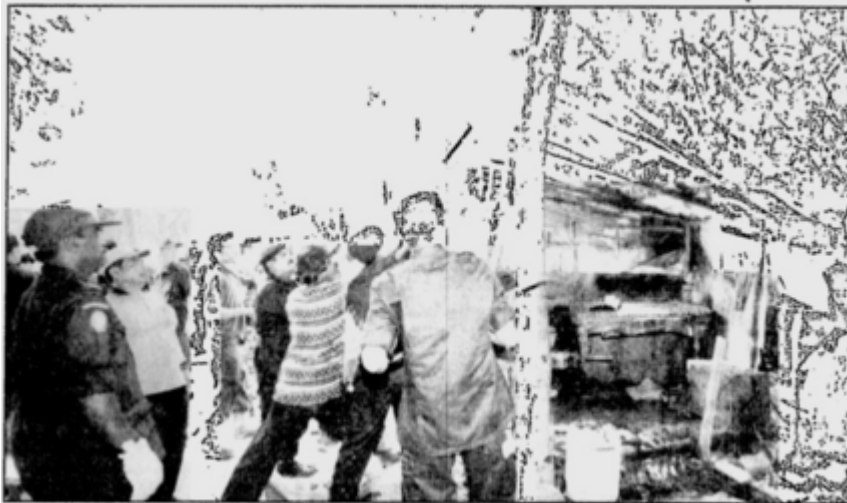
END OF THE ROAD ... Enforcement officers tearing down one of the 180 makeshift shelters