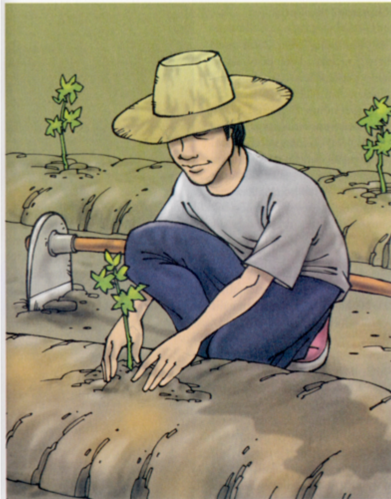
Pada masa lalu, pokok yang dinamakan limau manis ditanam dengan meluas oleh petani di Kampung Limau Manis.

yang berbuah dan sangat manis rasanya. Rupa buah itu seperti Limau tetapi rasa manisnya berbeza dengan rasa jenis-jenis Limau yang lain yang kebiasaannya masam. Kemudiannya, mereka telah memperkembangkan tanaman tersebut dengan menanamnya di celah-celah tanaman pokok Pinang dan Belinjau. Akhirnya tanaman ini telah berkembang di kawasan mereka dan ramai orang mengenalinya sebagai Limau Manis. Oleh itu nama kampung ini telah digelar sebagai Kampung Limau Manis."