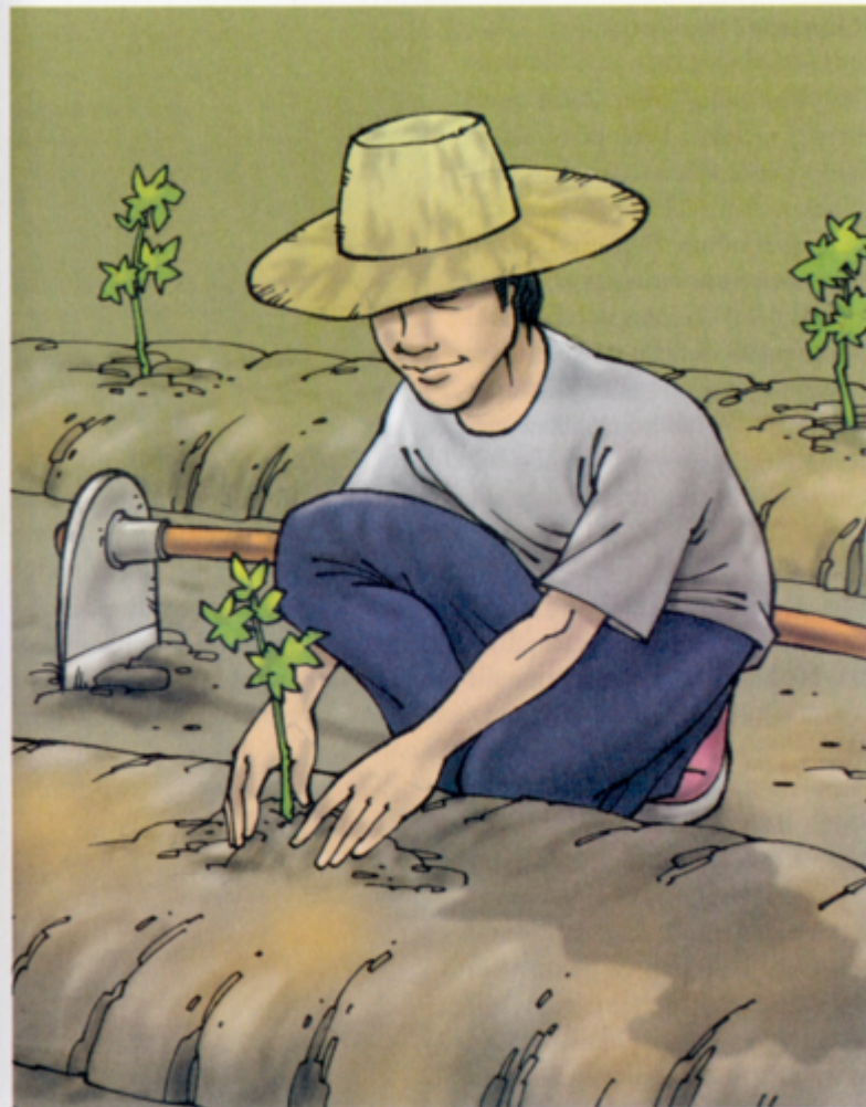
Pada masa lalu, pokok yang dinamakan limau manis ditanam dengan meluas oleh petani di Kampung Limau Manis.

yang berbuah dan sangat manis rasanya. Rupa buah itu seperti Limau tetapi rasa manisnya berbeza dengan rasa jenis-jenis Limau yang lain yang kebiasaannya masam. Kemudiannya, mereka telah memperkembangkan tanaman tersebut dengan menanamnya di celah-celah tanaman pokok Pinang dan Belinjau. Akhirnya tanaman ini telah berkembang di kawasan mereka dan ramai orang mengenalinya sebagai Limau Manis. Oleh itu nama kampung ini telah digelar sebagai Kampung Limau Manis."