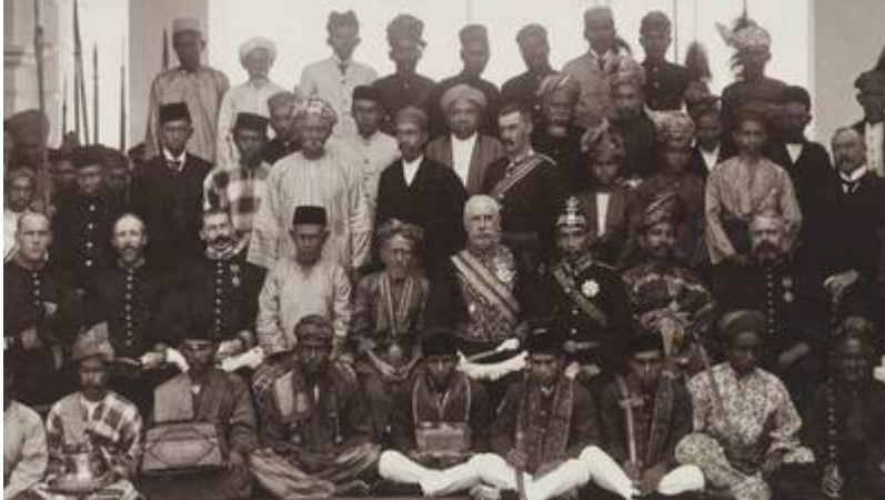
Kiri: Gambar pertama: "Gambar menunjukkan raja-raja dan pembesar Melayu serta pegawai-pegawai British yang hadir. Duduk dari kiri ke kanan : Hugh Clifford (Residen Pahang), J.P.Rodger (Residen Selangor), F.A.Swettenham (Residen Jeneral), Sultan Ahmad (Sultan Pahang), Sultan Abdul Samad (Sultan Selangor), Sir Charles Mitchell (Pesuruhjaya Tinggi), Sultan Idris (Sultan Perak), Tuanku Muhammad (Yang Dipertuan Besar Negeri Sembilan) dan W.H.Treacher (Residen Perak)."

"Mesyuarat Durbar Negeri-Negeri Melayu Bersekutu yang Pertama, Kuala Kangsar, Julai 1897").