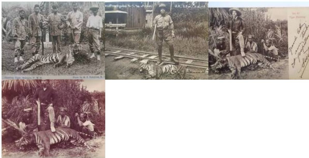
"WILD GAME HUNTING IN MALAYA" (Sustainable Living Institute (SAVE), October 03, 2016: