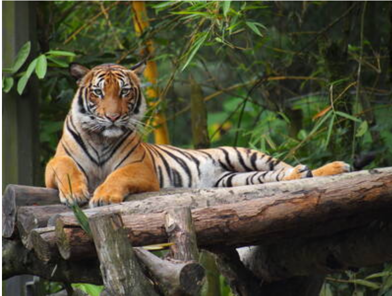
"Malayan Tiger at National Zoo Malaysia".