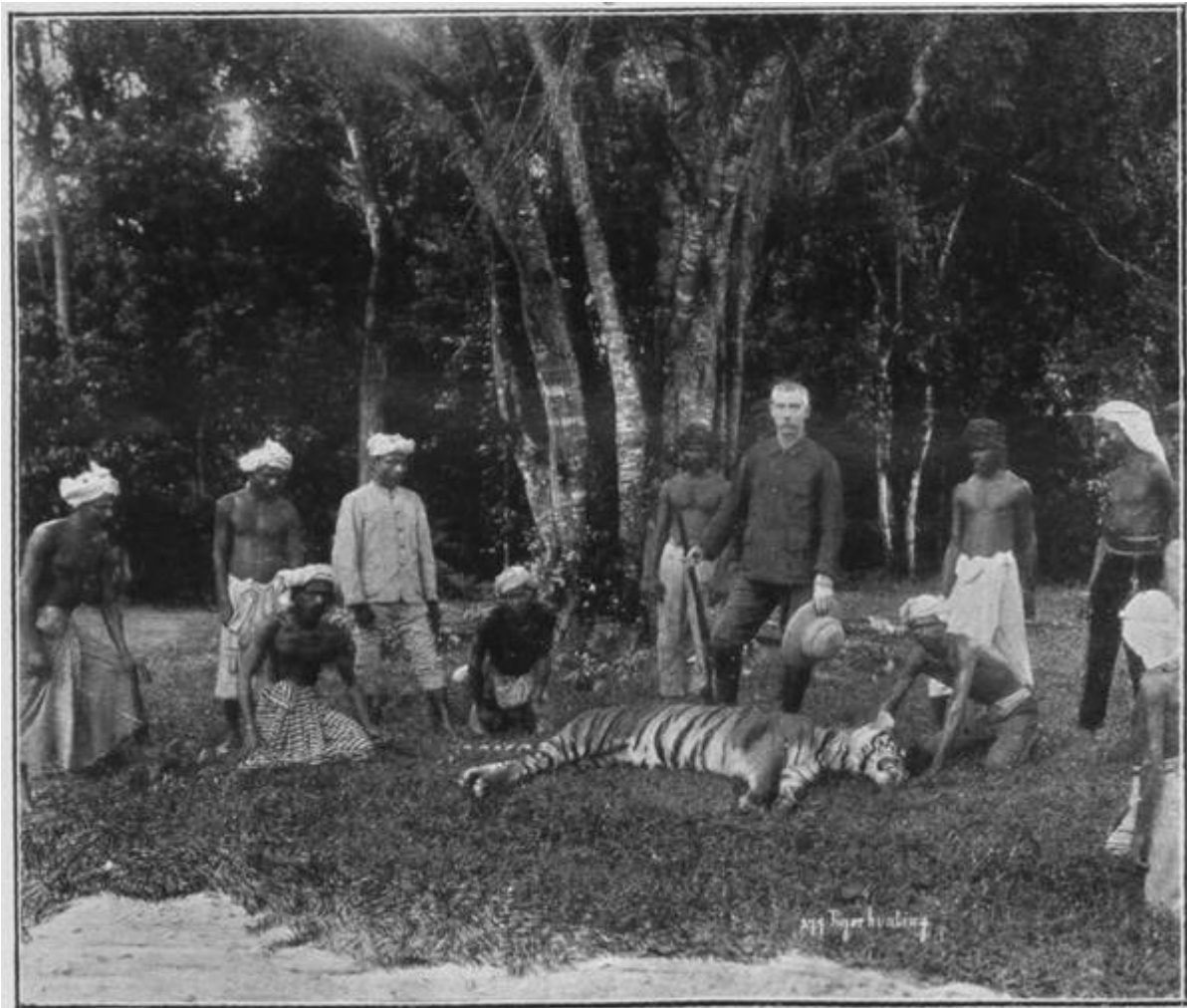
A TIGER HUNT.