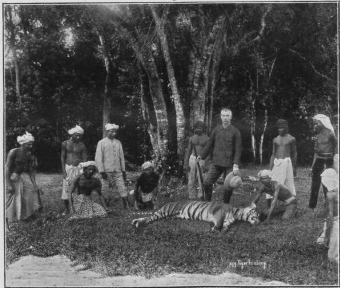
A TIGER HUNT.