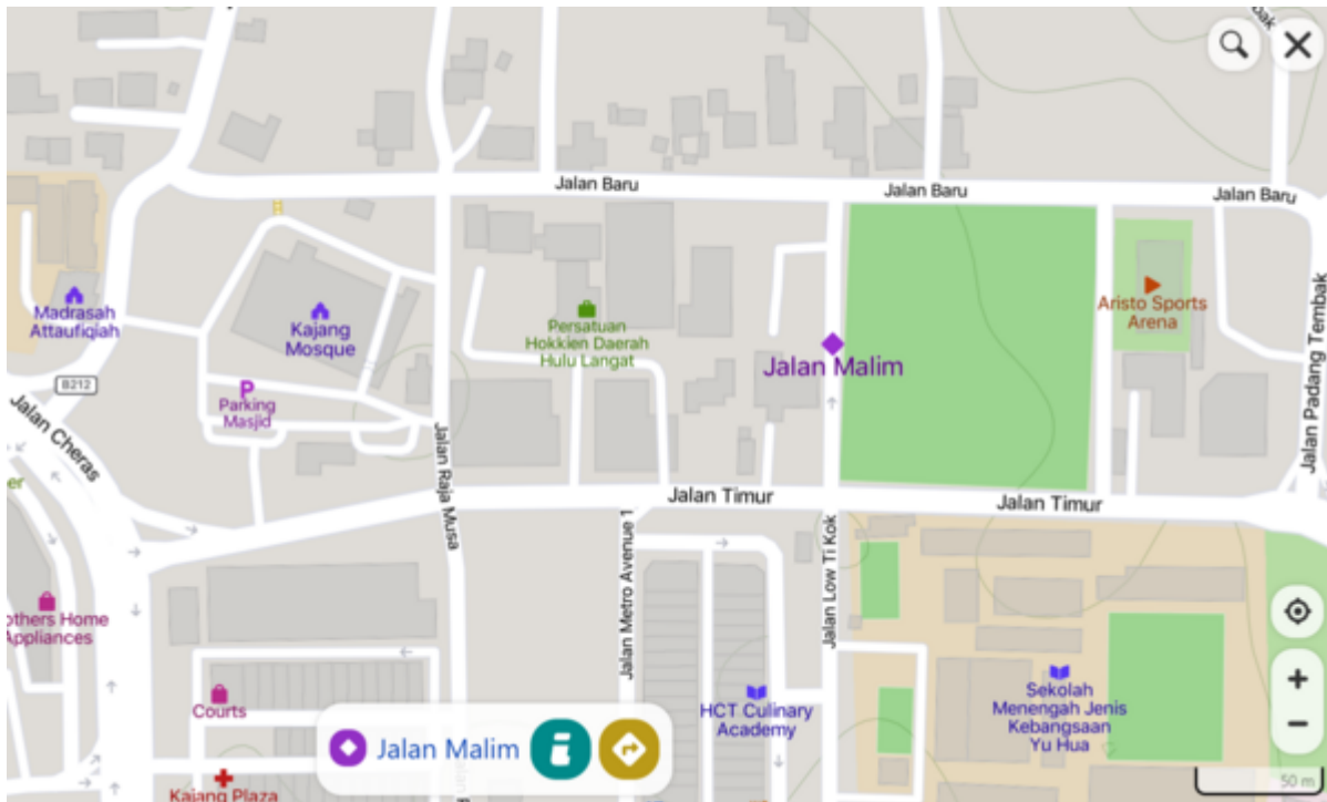
Lokasi Jalan Moulin (kini Jalan Malim).