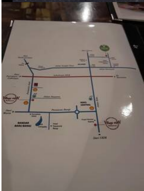
Kiri: "V View Restaurant" (Sasukei Spurs @ Google Maps, January 2015: " V View Restaurant ").