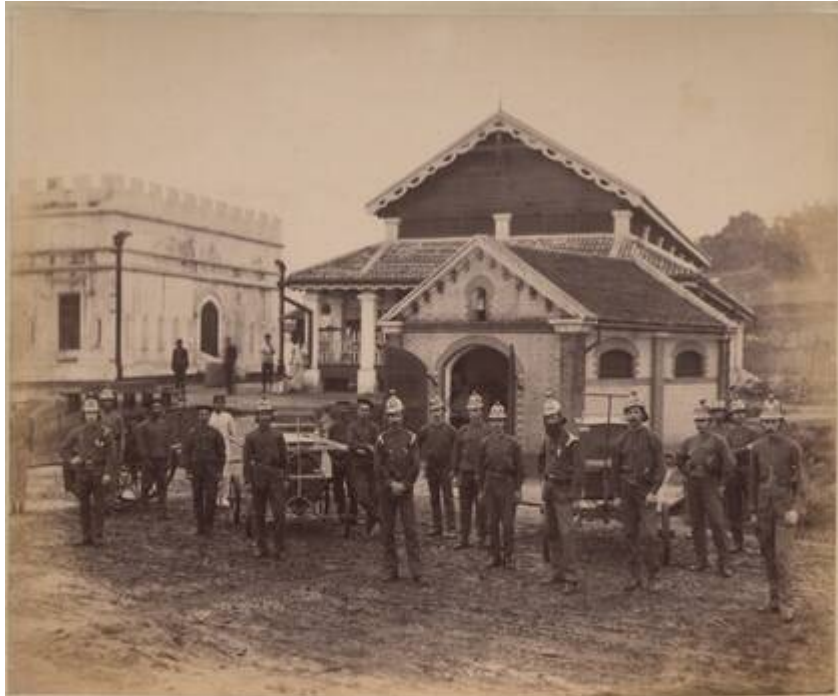
Central Police Station (built 1886). Police Barracks (1887-88). Fire Engine House. Kuala Lumpur Volunteer Fire Brigade.