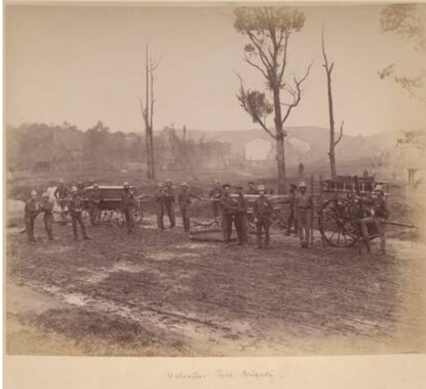
Volunteer Fire Brigade.

Kiri: “Central Police Station (built 1886). Police Barracks (1887-88). Fire Engine House. Kuala Lumpur Volunteer Fire Brigade.”