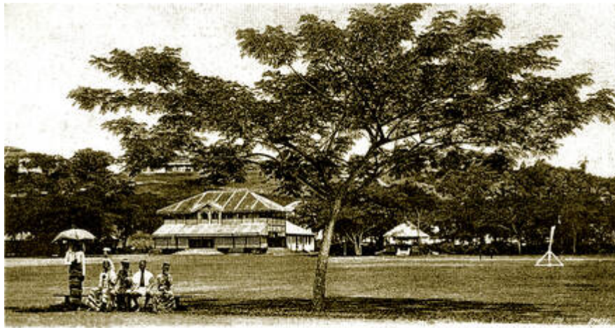
Kuala Lumpur - The Selangor Club