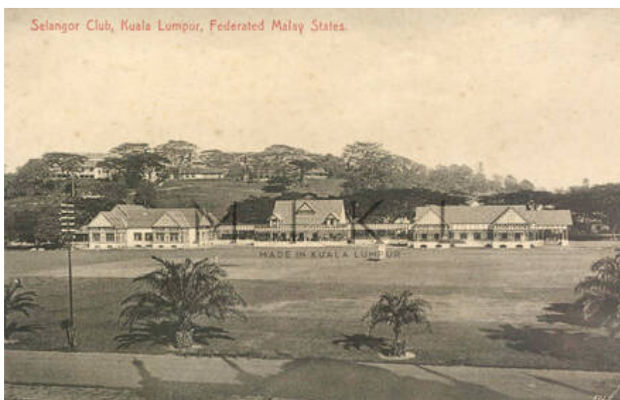
Selangor Club, Kuala Lumpur, Federated Malay States.

Bangunan asal Selangor Club: "The European social club was founded in 1884. Its building of timber structures was originally located at the east side of the parade ground. In early 1890s, it acquired few premises and built a two-storeyed structure of brick and tiles as the Club's centre-piece, on the west side of the Padang, designed by AC Norman."