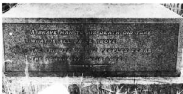
Memorial inscriptions on red granite above the grave of H. C. Syers in Venning Road cemetery, Kuala Lumpur.