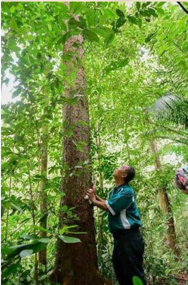
Kiri: Contoh pokok gutta percha zaman dahulu (1900-an).