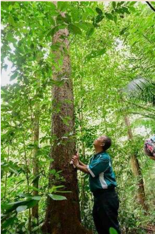
Kiri: Contoh pokok gutta percha zaman dahulu (1900-an).