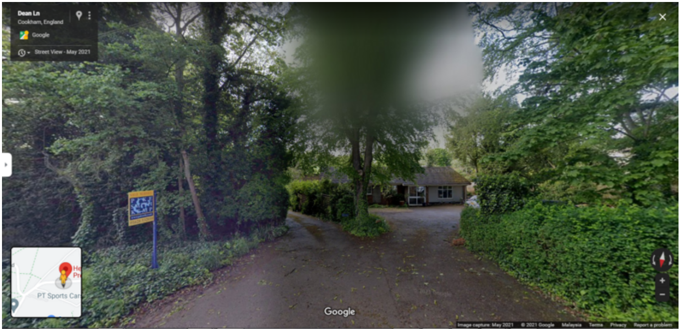
\\ Peninggalan Rumah I.H. Pratt kini.

Pengakuan penting: Kami bukan ahli sejarah! Sila klik di sini untuk penjelasan lanjut.