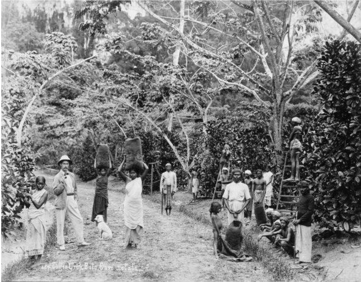
Ladang kopi di Batu Caves Estate, Selangor, tahun 1899 (RBG KEW, 12th February 2015:

"Coffee harvest at Batu Cave Estate, Singapore, 1899").