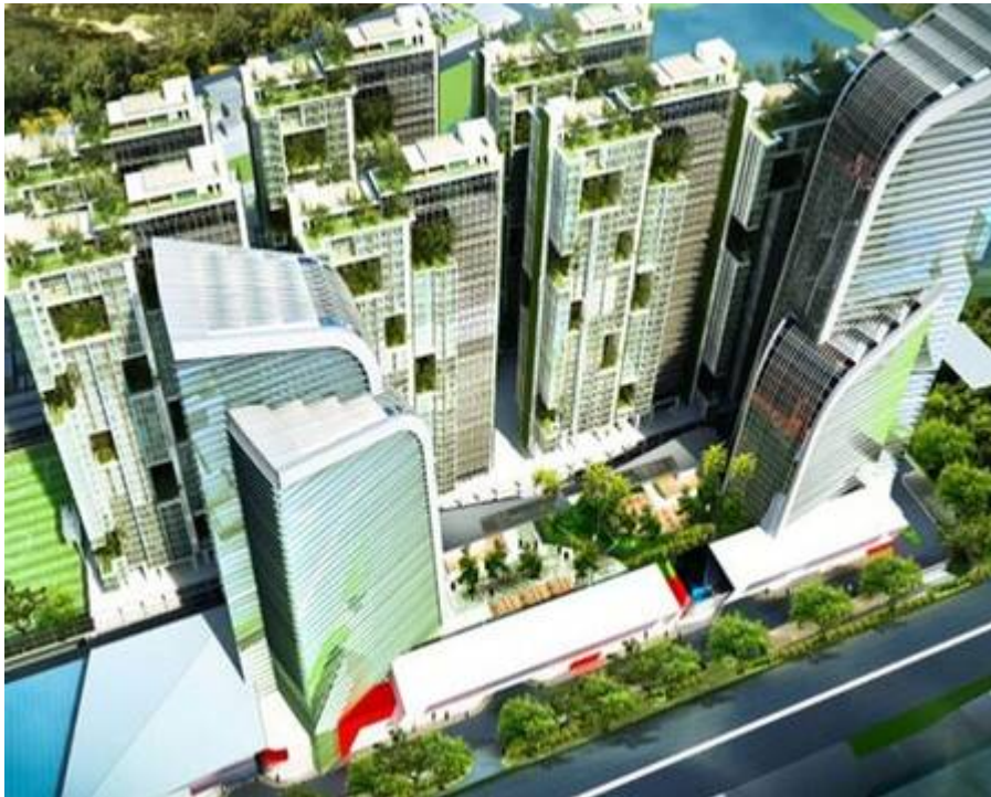
(Ibx Hardware Sdn Bhd, 2018: "DATUM IN CITY @ KELANA JAYA").