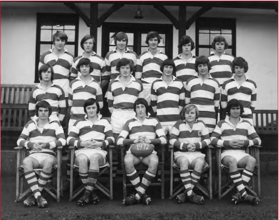
‘Hair today, gone tomorrow!’ – rugby players, 1972

I joined Hurstpierpoint College in Year 7 and spent my Senior School years in Fleur de Lys and Chevron Houses. After ‘A’ levels in 2005 I left to study Medicine at the University of Leicester. After sitting, and subsequently passing, my final examinations earlier this year I was required to undertake a medical elective in a different part of the world. I chose to carry out my 6 week placement in Tobago. With financial