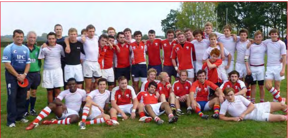
OJ Rugby v School, October 2011

The OJ Christmas match v Brighton College was cancelled because of injuries and family commitments.