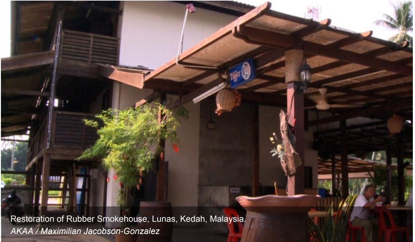
Restoration of Rubber Smokehouse, Lunas, Kedah, Malaysia.