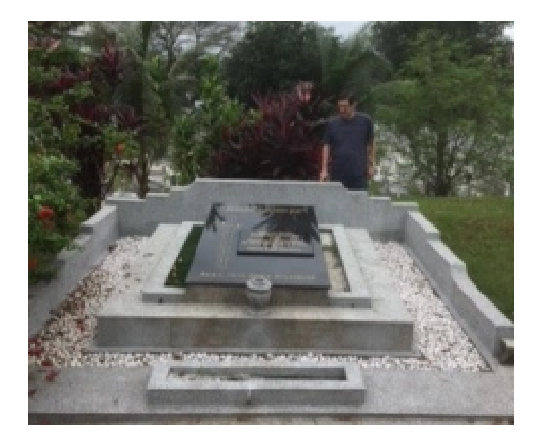
Kuala Lumpur Civil Cemetery, Cheras Road

In "Kuala Lumpur's Lesser Known Cemeteries"