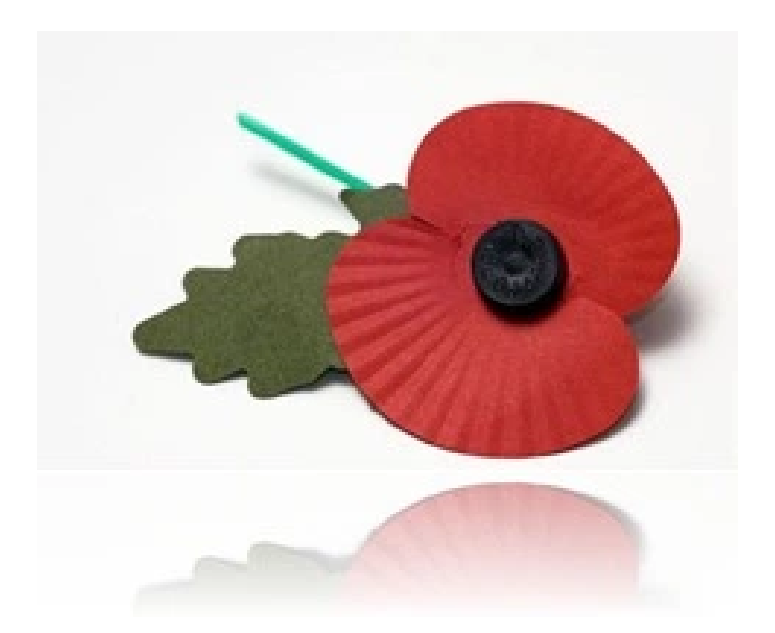
Kuala Lumpur's Lesser Known Cemeteries

In "Kuala Lumpur's Lesser Known Cemeteries"