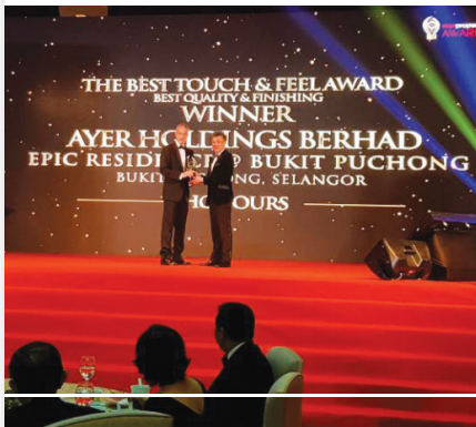
Star Property Awards 2018