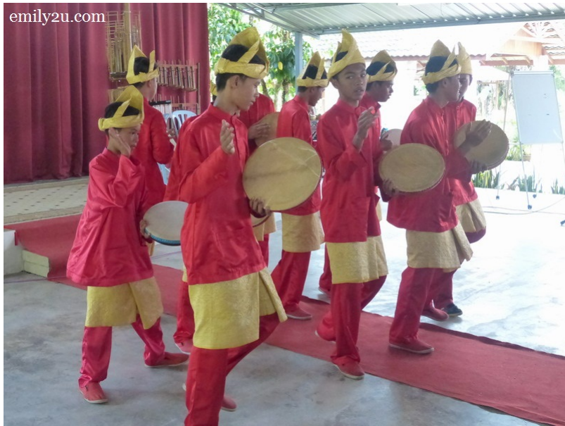
6. Kompong presentation by award-winning troupe, AJAS