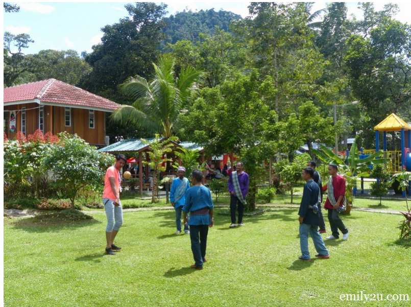
4. playing sepak raga