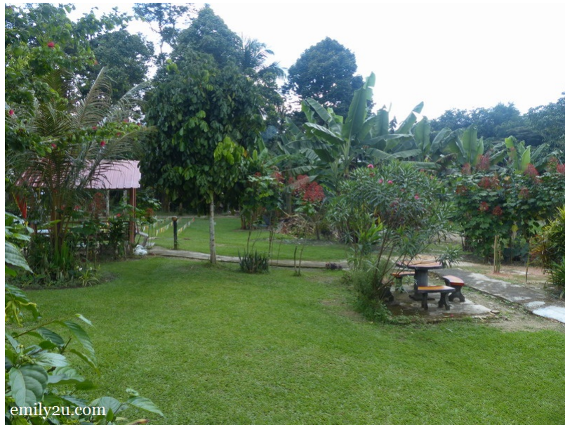
2. the green garden of Orchard Santika Homestay