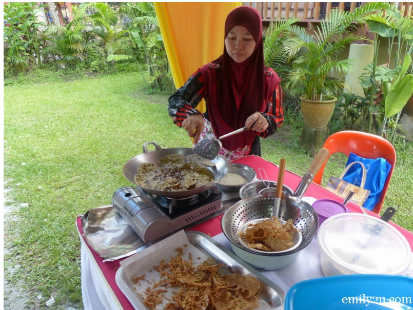
8. frying tumpi