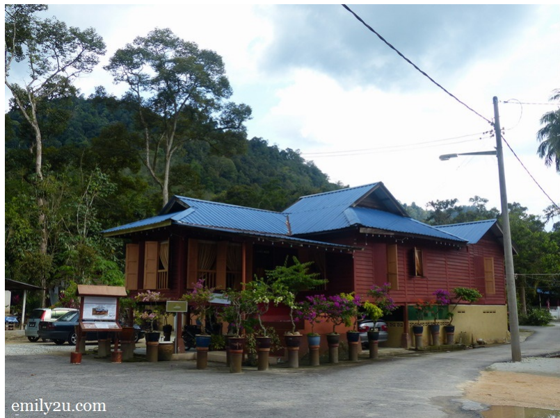
3. a traditional house

If you have been following my blog, you would know that I definitely prefer hotel stay, rather than budget or homestay.