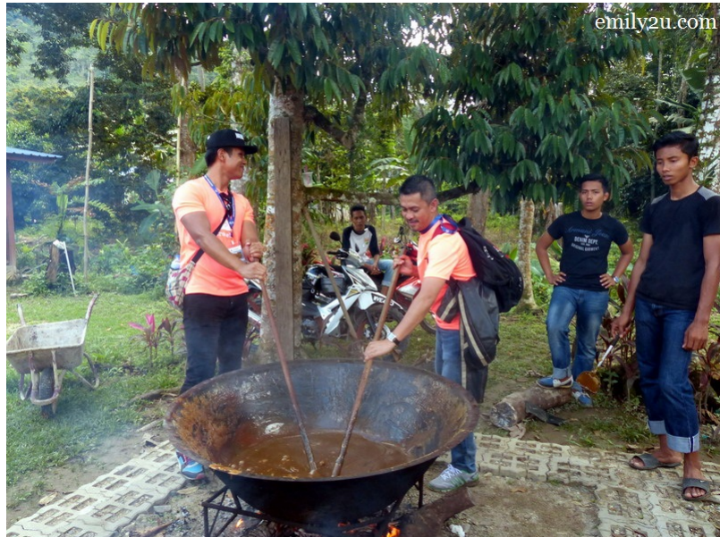
9. cooking dodol

I'm quite embarrassed to admit that this was where I finally figured out how angklung, the traditional musical instrument, works. Oh-oh, I didn't figure out, I was taught. LOL