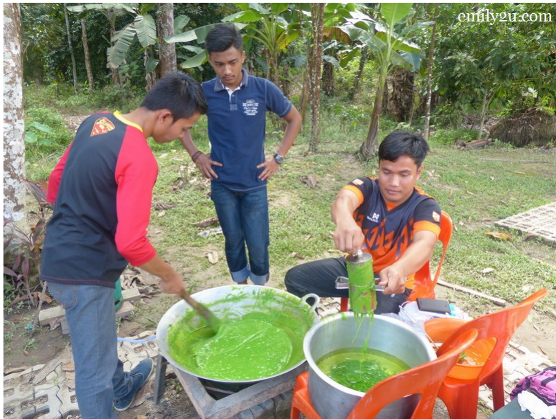
10. making the green jelly for cendol