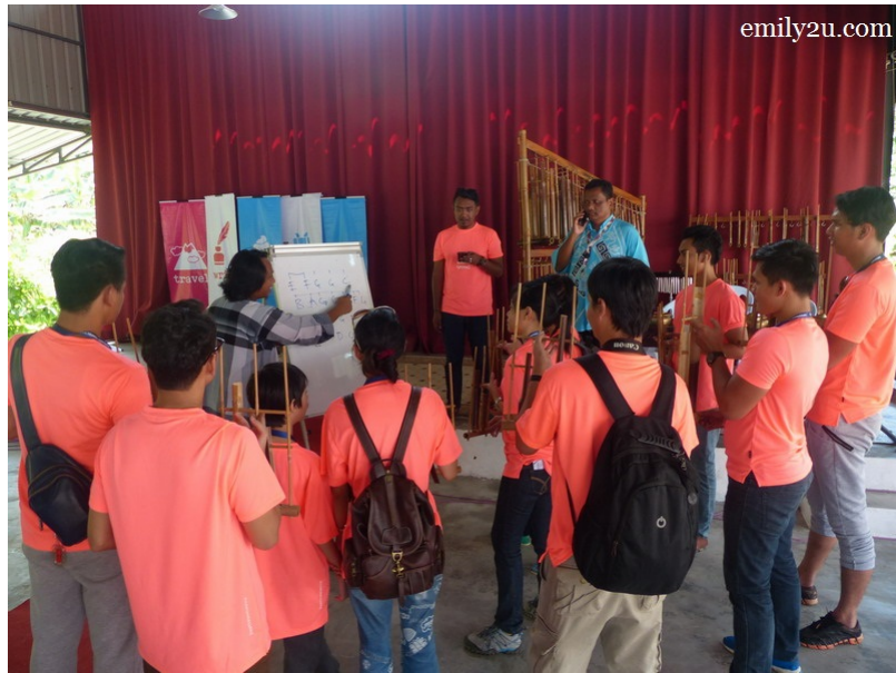
12. visitors learn how to play angklung