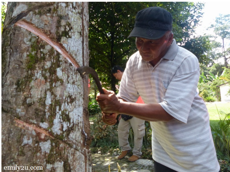
11. rubber-tapping demonstration

We also witnessed the “cukur jambul” ceremony, an important rite of passage for a Muslim baby, usually held at the end of the new mother’s period of abstinence (pantang).