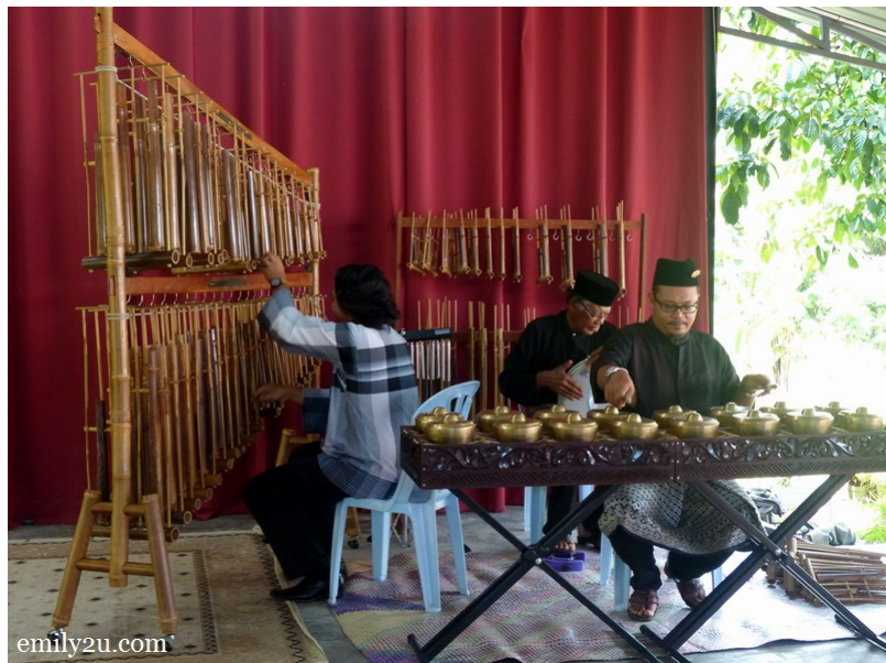
5. angklung performance

Nevertheless, I was open to try new offers and am glad to say that Orchard Santika Homestay is one of the better homestays that I have experienced.