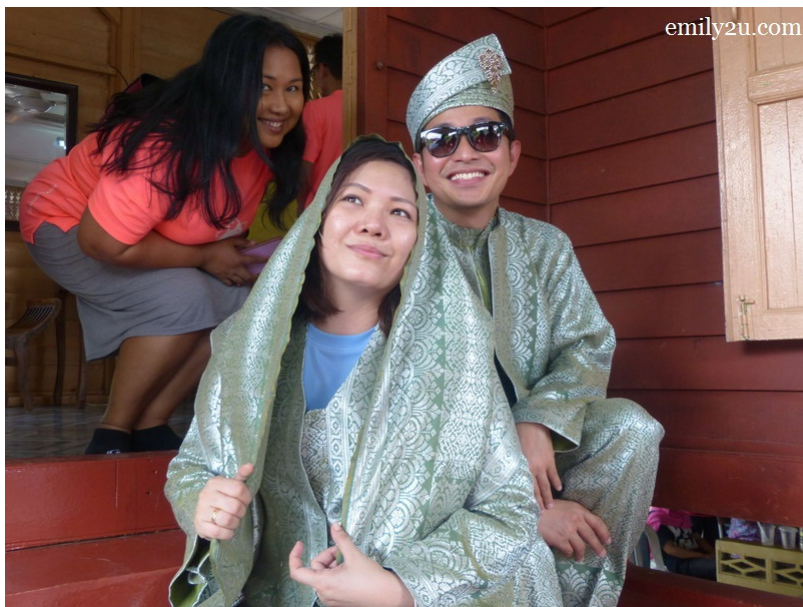
7. mock wedding

Coincidentally, when I was there, Orchard Santika Homestay Hulu Langat was the venue for the Selangor Mini Craft Carnival (Mini Kraf Karnival Selangor) 2015, so there were plenty of chances for me to get hands-on in various traditional crafts.