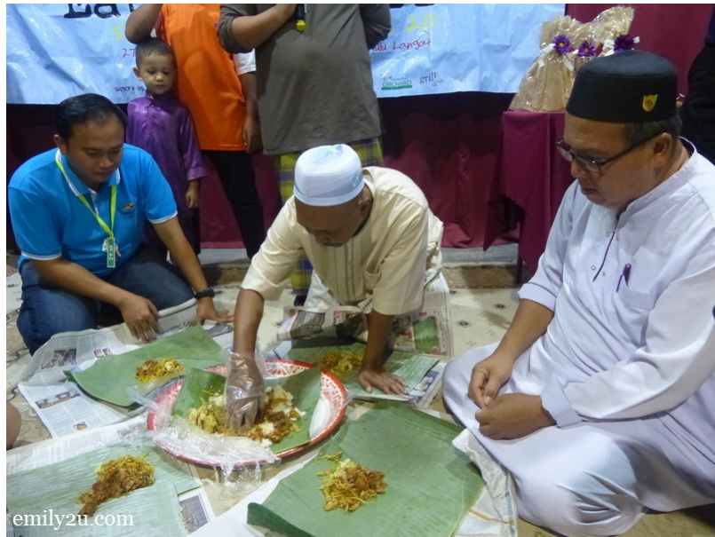
14. a demonstration on how nasi ambeng is shared