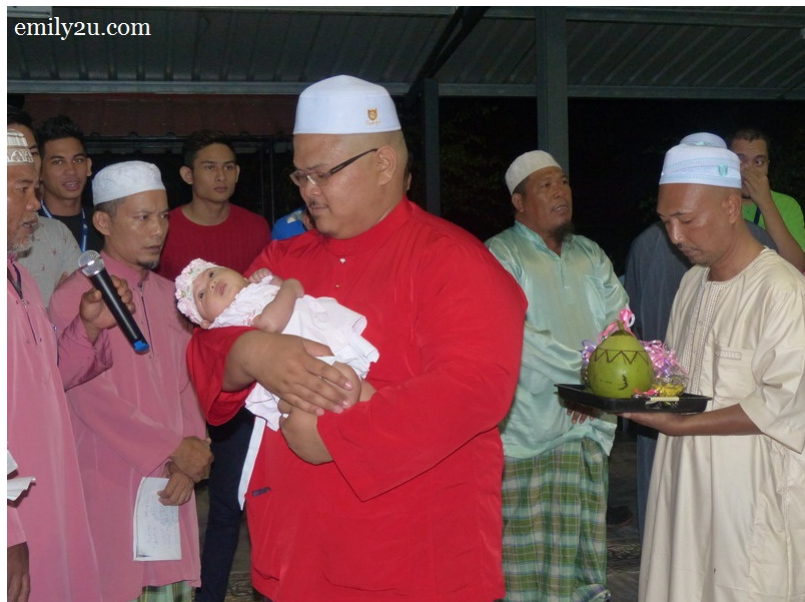
13. Cukur Jambul ceremony

This was also where I had my second Nasi Ambeng. I remember the first time I tasted this speciality was in Terengganu. This time around, it was of a different variety, Javanese-style.