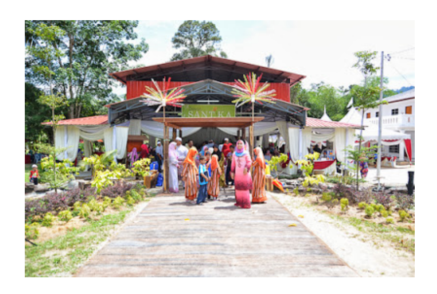
Santika Multi-purpose Hall

[http://3.bp.blogspot.com/-BVrhD202Y5I/UmFrx9zc86I/AAAAAAAAAAAAQQ/LQ\_7ELbpWhc/s1600/DSC\_1545.jpg] \\