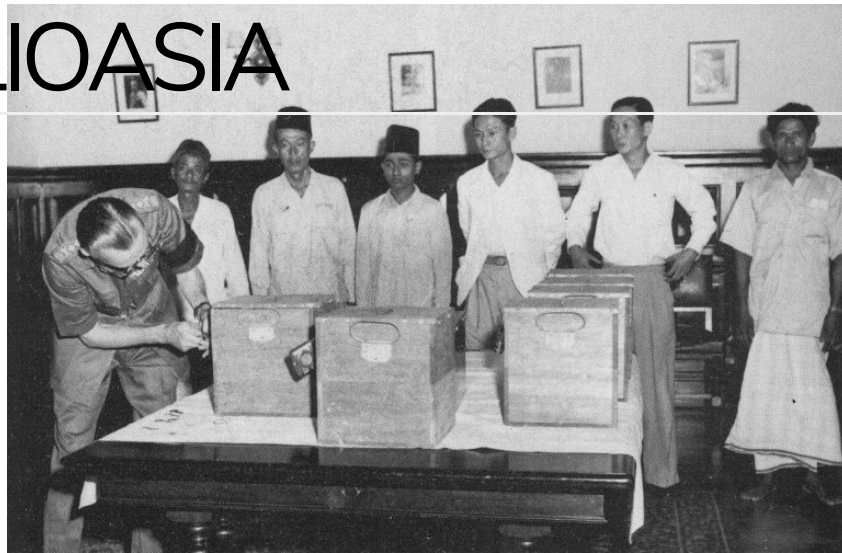
Templer is seen here opening boxes containing completed questionnaires with information about communists, in the presence of representatives from Tanjung Malim, Perak, 6 April 1952. Images reproduced from Cloake, J. (1985). Templer: Tiger of Malaya: The Life of Field Marshall Sir Gerald Templer (n.p.). London: Harrap Ltd. (Call no.: RSING 355.3310942 TEM.C)