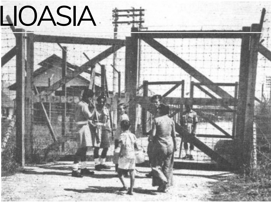
The heavily guarded entrance of a New Village near Ipoh, Perak, 1952. Image reproduced from Yao, S. (2016). The Malayan Emergency: Essays on a Small, Distant War (p. 101). Copenhagen: Nordic Institute of Asian Studies. (Call no.: RSING 959.5104 YAO).