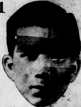
THIS IS CHIN PENG. The brains behind the terrorism in Malaya, he offers $250,000 to anyone who has information which will lead to his capture.

KUALA LUMPUR, Wednesday. THE FEDERATION GOVERNMENT today announced a reward of $250,000 for "bringing in alive" or giving information leading to the capture of the leading Malayan Communist terrorist, Chin Peng. The new reward is three times the reward of $80,000 offered for Chin Peng in June last year. Chin Peng, 31-year-old secretary-general of the Central Executive Committee of the Malayan Communist Party, is the man responsible for directing the armed Communist revolt in Malaya. A sum of $125,000 will be paid for information leading to Chin Peng's killing, in June 1951, $50,000 was offered for his death. An indication that the new rewards might be directed at the "bringing in alive" of the leading Communist figures in the Federation is given in the Government statement announcing the rewards. "BRINGING IN ALIVE." THE STATEMENT SAYS, "INCLUDES THE POSITIVE ARRANGING WITH