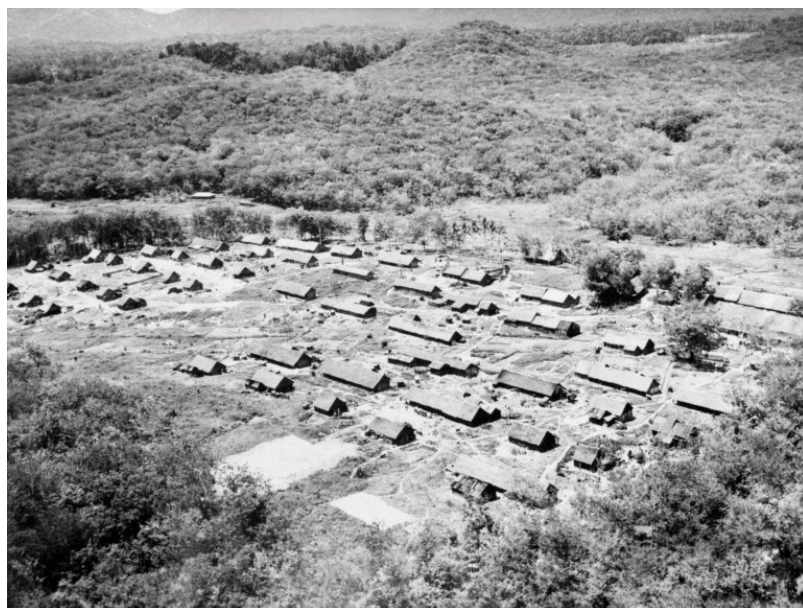
Aerial view of a newly completed village where squatters would be resettled. Copyright Imperial War Museum (K13796)

These measures had an adverse impact on the livelihoods of the people. Apart from having to wait in long queues to be searched by security officers, those who worked outside the villages were prohibited from taking their mid-day meals with their families. In fact, all they could have on them was a bottle of water; tea or coffee was not allowed to be brought out of the villages “for these would be welcome drinks to the enemy”. 13 Those in the trucking business, too, were affected as the regulations meant that lorries could only stop in certain areas, which in turn impeded the supply of food to small villages.