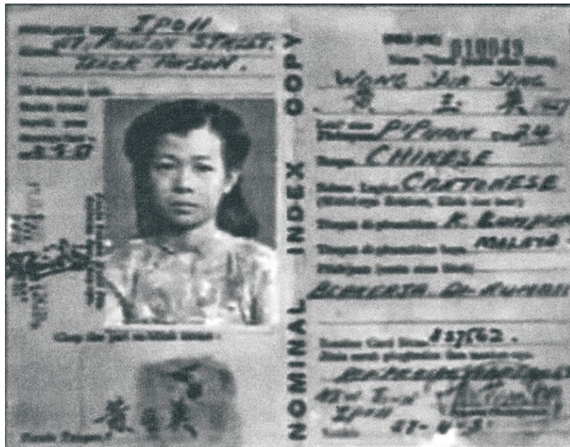
An identity card issued during the Malayan Emergency (1948–60). Image reproduced from Yao, S. (2016). The Malayan Emergency: Essays on a Small, Distant War (p. 57). Copenhagen: Nordic Institute of Asian Studies. (Call no.: RSING 959.5104 YAO)

To further ensure that the communist guerrillas were isolated from the main population, the predominantly Chinese villagers living in squatters in the jungle fringes were relocated to settlements called "New Villages". These villagers were "strategically sited with an eye to defence, protected with barbed wire and guarded by a detachment of Special Constables, until they were each able to form their own Home Guard units". 8