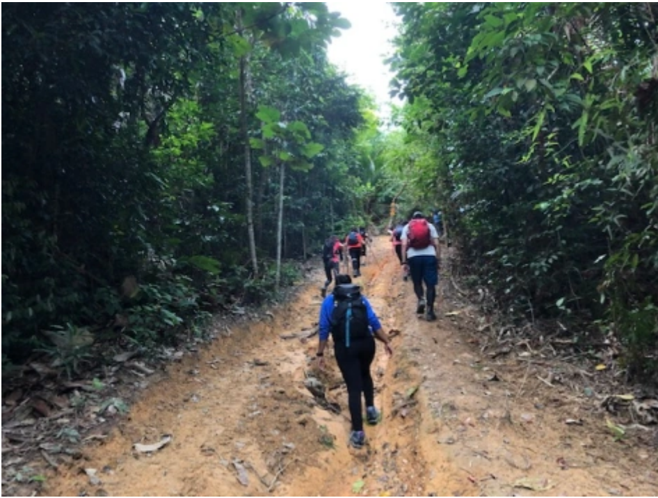
Hiking up past Bukit Bujang. The locations, which have been named by the bikers that use these trails are witty descriptions rather than geological/topographical features. Neither Bukit Janda nor Bukit Bujang are peaks.