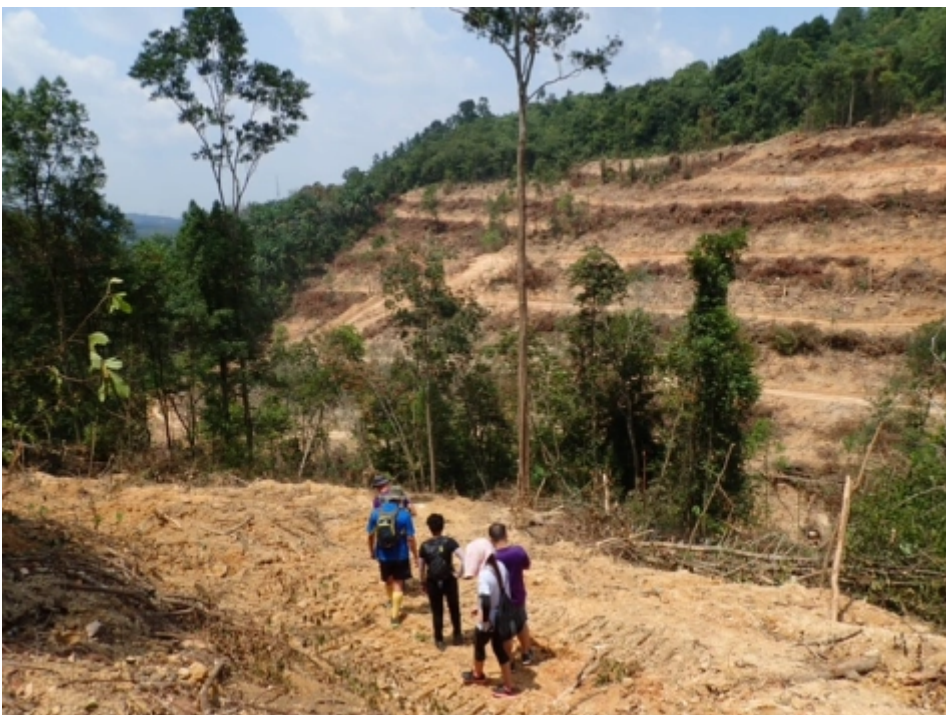
Bukit Unggul 2019: How it ended.....

In contrast, my hike with the Trailblazers on Malaysia Day 2021 began from the end of Jalan Sahabat, and approached Bukit Tunggal peak and its trig from the north.