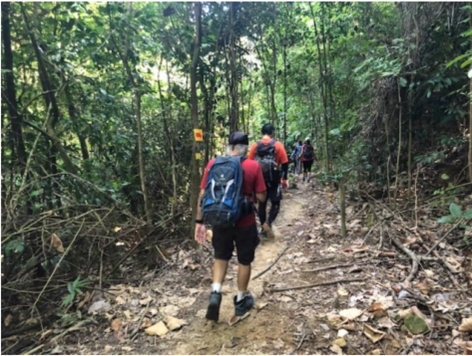
From the bottom of Bukit Cuak we continue along the mostly straight flat trail to Bukit Tiga Beradik.