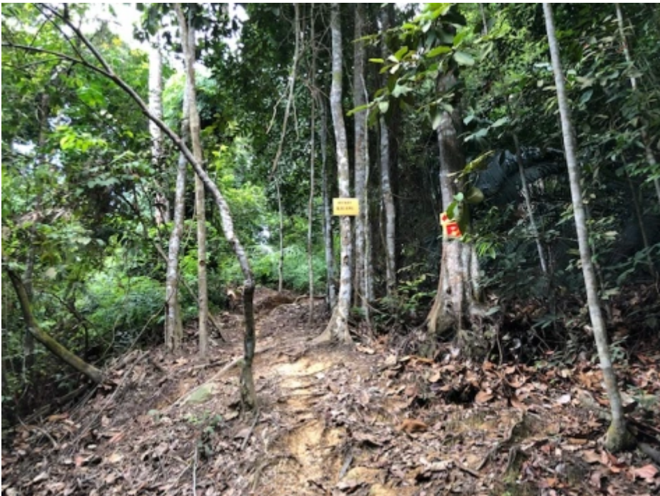
Passing Bukit Kacang. No peanuts found, so either it's named because it's an easy hill to conquer or the bikers who named it are being ironic and it's a tough nut to crack....