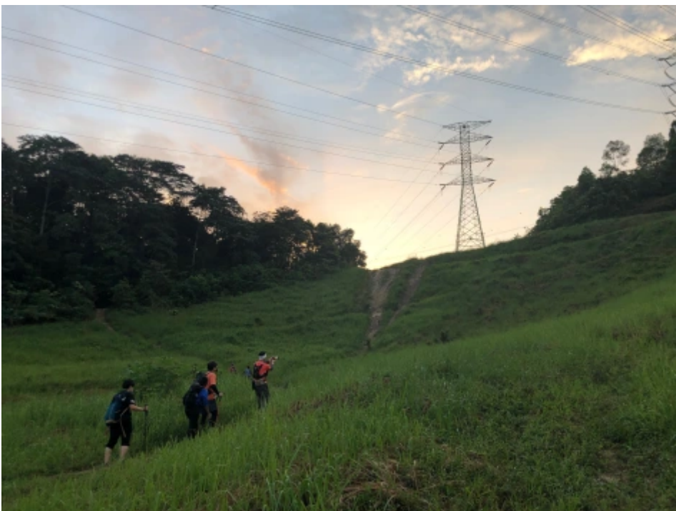
To the right, Bukit 1000, to the left, the trail that we took.