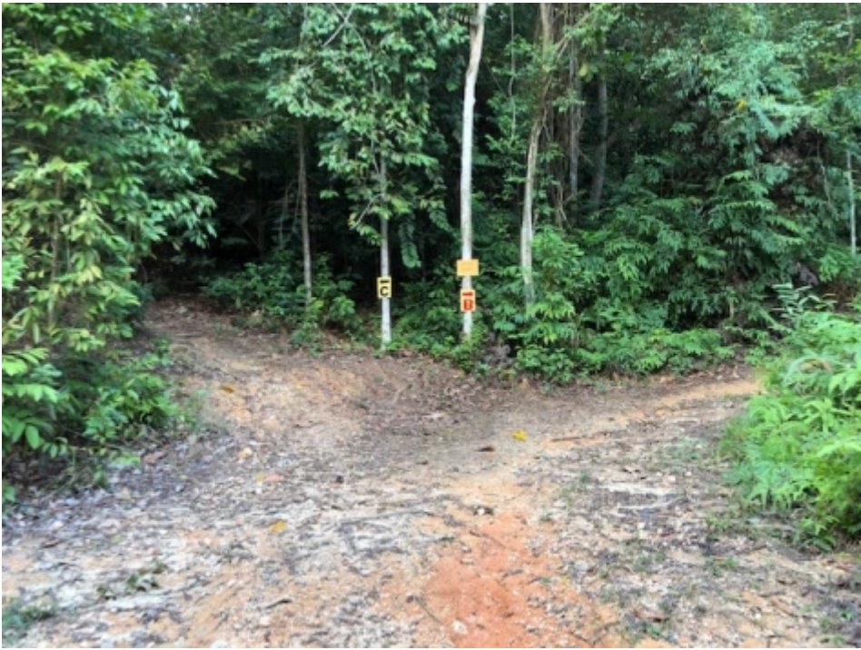
Bukit Janda, the second of the forks in the road.