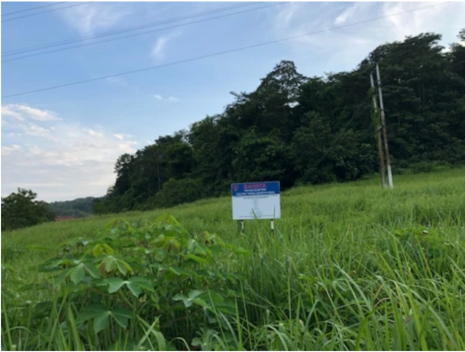
Bukit Tunggul 2021 – first group hike after MCO3.