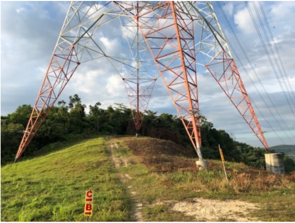
The overlord of Bukit Tunggul pylons.