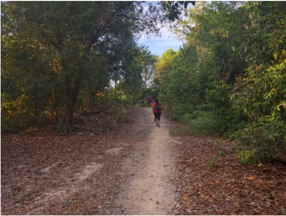
The broad trail on the other side of the thicket....