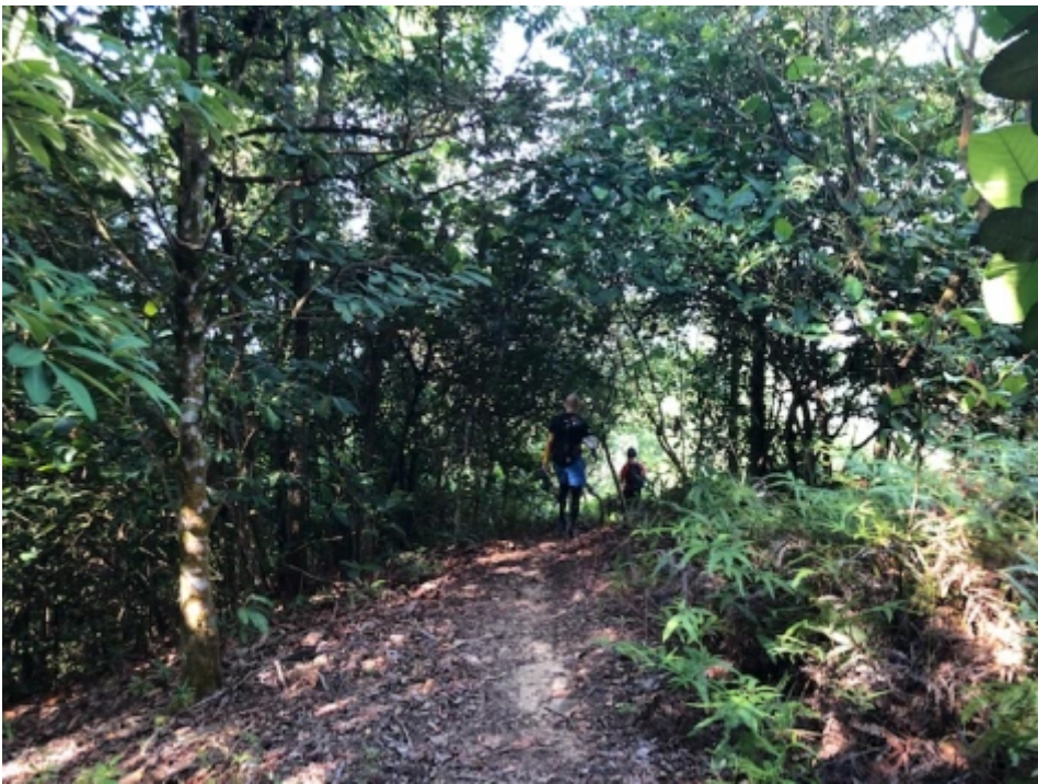
Through the forest on the other side of the pylon at the peak to the pylon at the border with Negeri Sembilan.

Sparse but leafy, we emerged 15 minutes later by yet another pylon (ugh, if I have to use that word one more time). This one is on the border of Negeri Sembilan with views of Nilai.