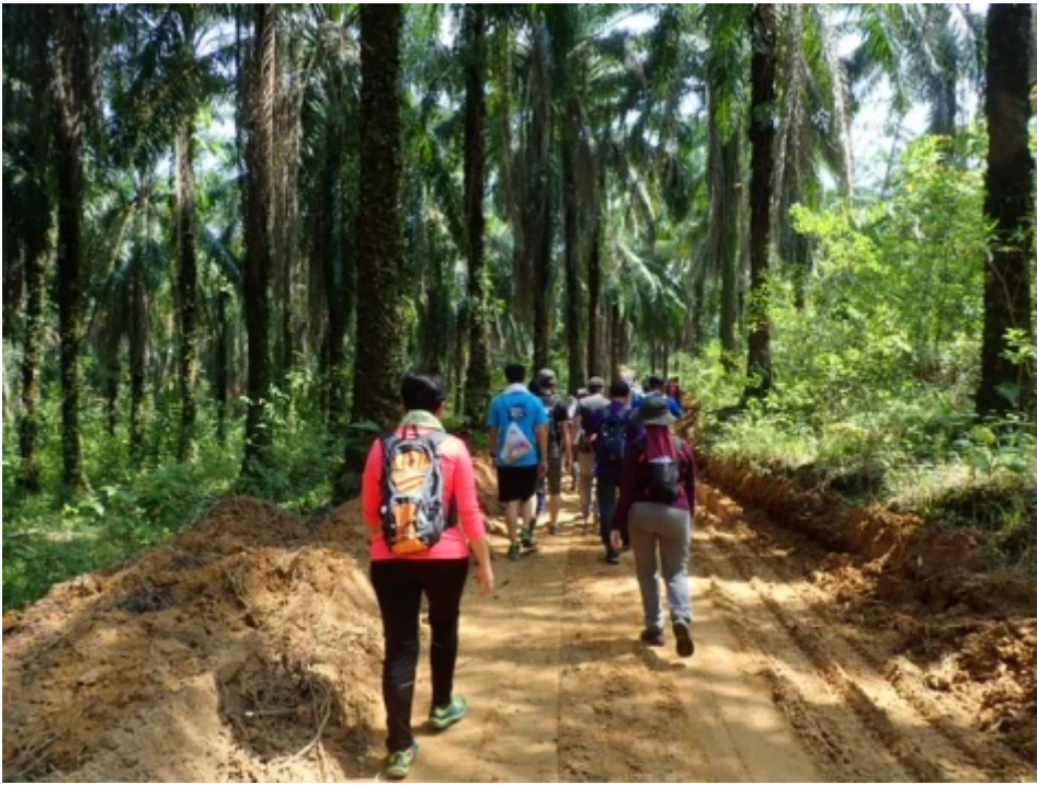
Bukit Unggul 2019: How it started.....