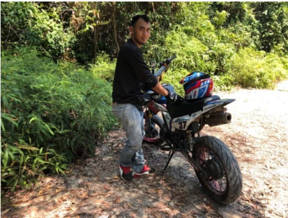
One of the bikers we met on the way back to our vehicles.....

Loop completed, the Trailblazers and I were making our way back along the wide dirt track when several motorbikes roared past us. Their presence signalled the unofficial end of the hiking shift and beginning of the biking shift. Though I'm not usually a fan of high impact forest use, it was clear that it's the bikers that maintain these trails and the pleasure derived from their use is a shared one, for which I'm grateful.