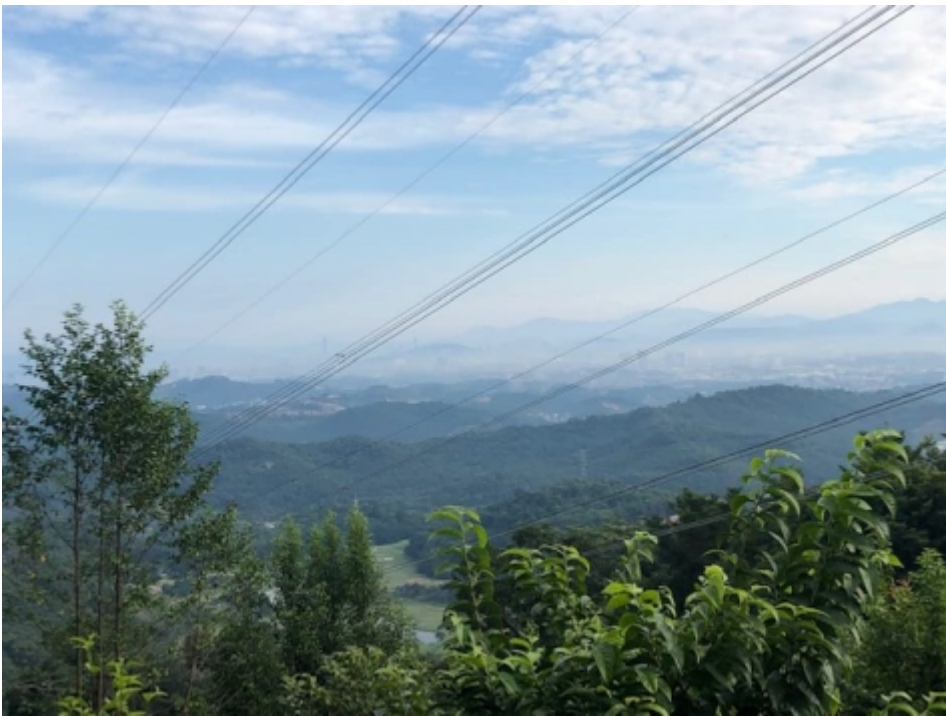
Bukit Unggul Country Club's golfing greens at the foot of Bukit Tunggul.

Oh wait, did I say Bukit Unggul? Don't I mean Bukit Tunggul? This had me stumped too but my guess is that the Country Club (where the golf course is located) chose to drop the "T" to convey prestige, since "unggul" is the Malay word for excellence and "tunggul" is the Malay word for stump and colloquially means stupid. Lol!