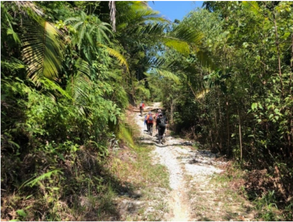
At the top of the hill we made a quick detour through the forest to emerge just above Bukit Bujang.