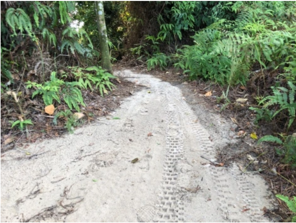
Bike tyre tracks even up here....