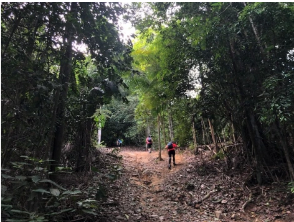
The wide track eventually narrows into a foot trail.

After some slogging, the ascending track narrows to a single footpath just before Bukit Beirut. The name is something of a misnomer since Bukit Beirut lacks a Beirut (or trig as it's also known). What it did have is great views of Bukit Unggul Country Club's 18-hole golf course and the faint outline of KL city's most prominent buildings through the early morning haze.