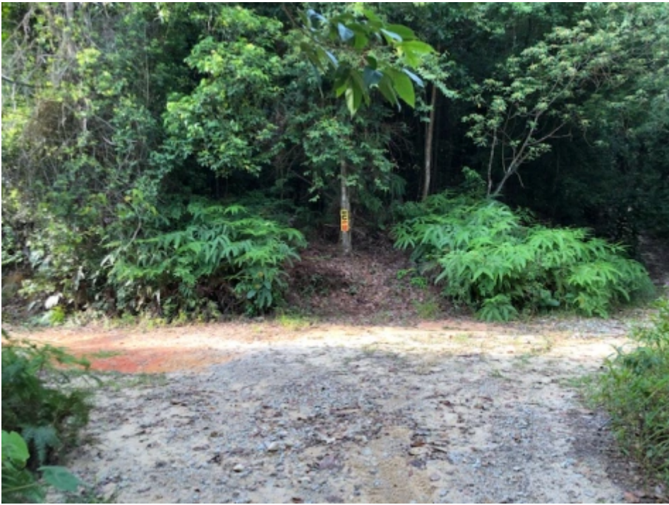
The first major fork in the road.