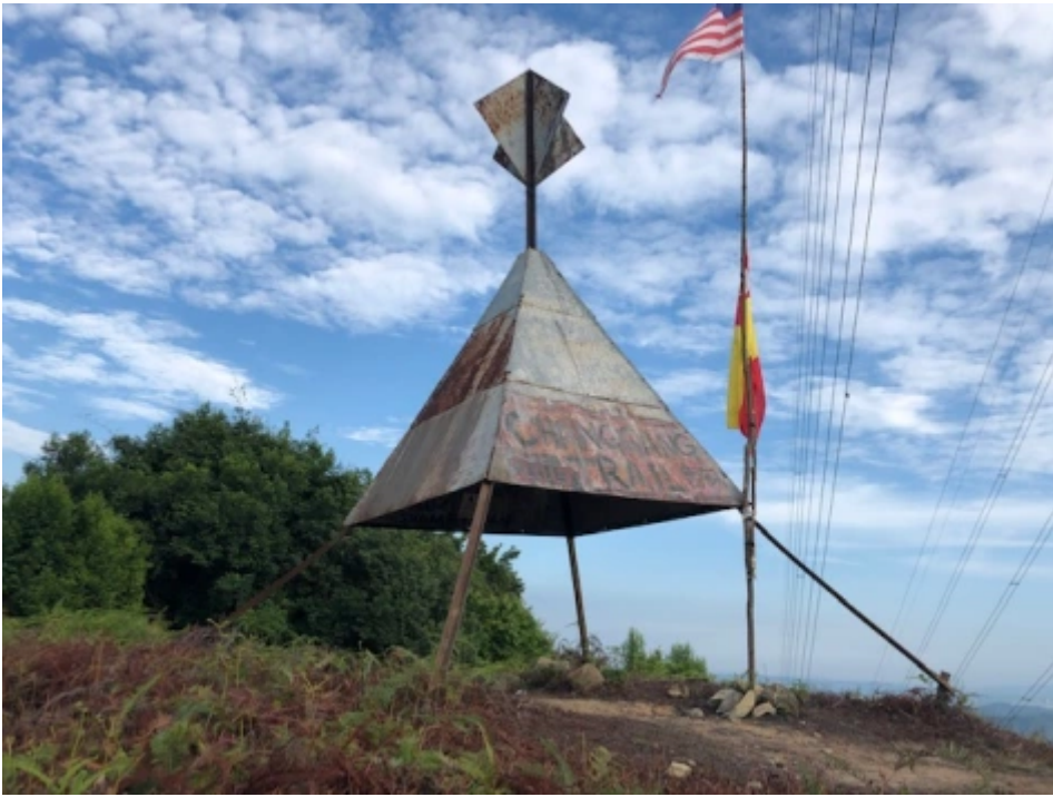
The beirut aka trig. You can spot it from Bukit Beirut but technically it's located atop Bukit Tunggul.