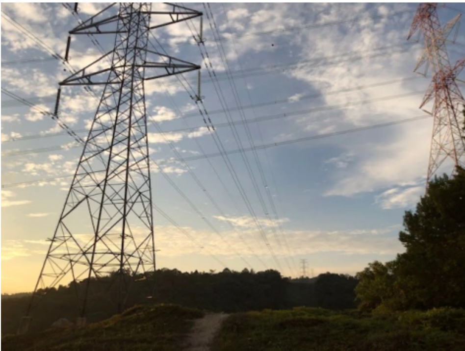
The hilltop trail towards the red and white pylon.

Entering the forest on the other side, we emerged at another pylon. Rather than duck into the the copse of trees beyond it, we made our way along an open trail until we came to a colossal red and white monster of a pylon.