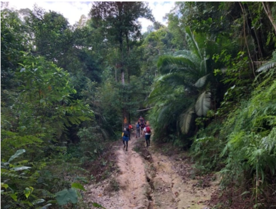
After heading left, we began our ascent....