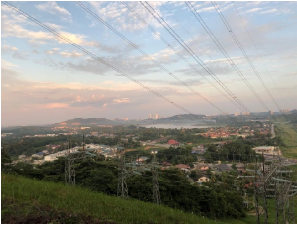
Home, just across the water....