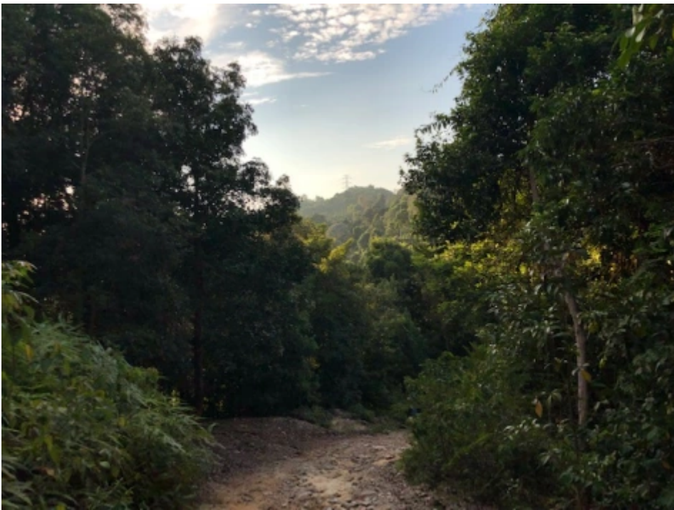
Like life, this ones has a lot of ups and downs....

We stuck to the most obvious trail until we arrived at a fork 30 to 40 minutes after starting out. Proceeding left we climbed up towards Bukit Janda, itself a fork. This time we went right passing Bukit Bujang along the way.