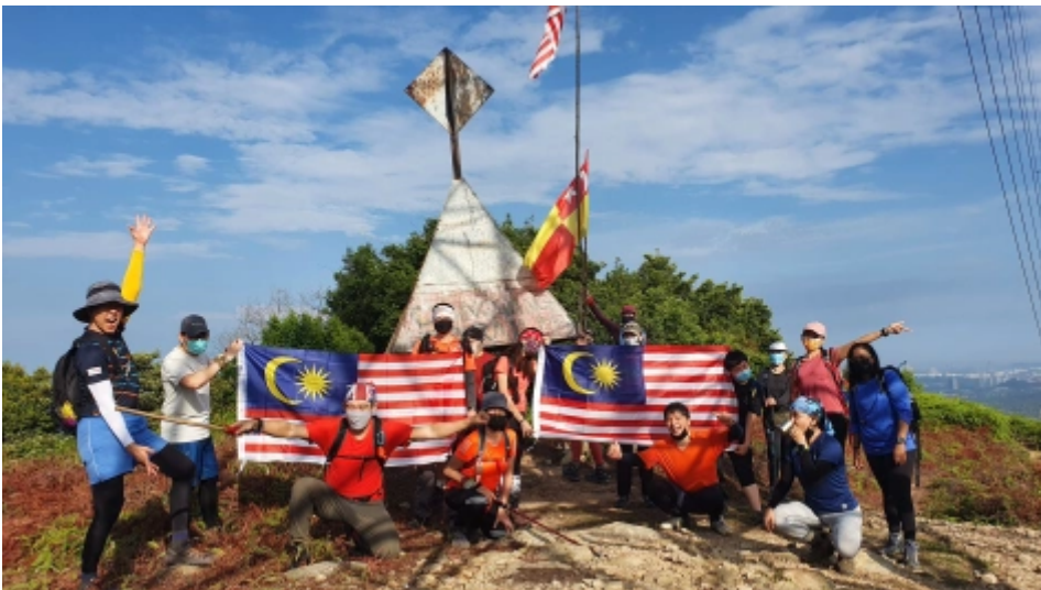
Happy Malaysia Day, everyone!

We took a short break at the summit of Bukit Tunggul and celebrated Malaysia Day with photos by the trig, and cups of coffee and slices of Kelvin's butter cake beneath the peak-side pylon.