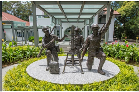
Malay Regiment sculpture