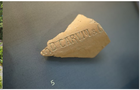
Marseille roof tile