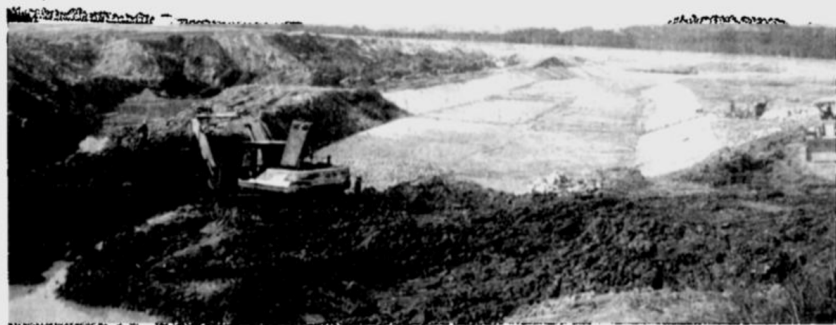
WORK IN PROGRESS ... to level the river bed of Sungai Air Hitam and developed it into a lake garden.

There will be a Plaza Cempaka to sell handicraft and a food court.